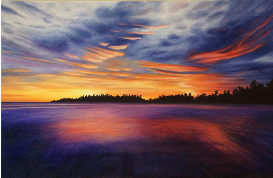
Sunset over Purdue by Bert Liverance

Check out the amazing arts and crafts by fellow SSCA members in this year's virtual art show! There's still time to submit a picture of your Georgian Bay artwork.