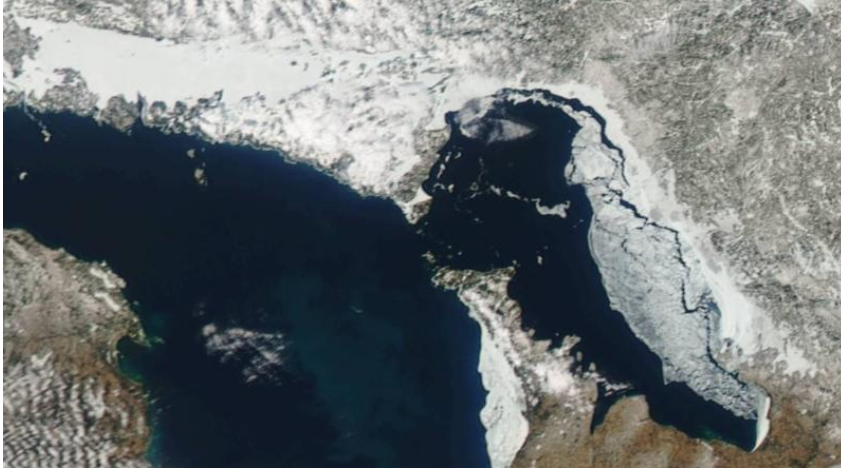
NASA Satellite image of Georgian Bay & Lake Huron taken March 29th. For more Water Level Information go to the GBA website Water Levels